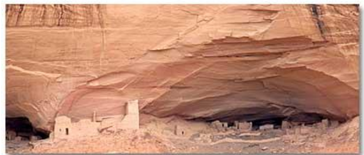
Canyon de Chelly Mummy Cave ruins

Like their cultural kin – the Mogollon and the Hohokam – in the deserts to the south, the earliest Anasazi peoples felt the currents of revolutionary change during the first half of the first millennium. Perhaps in a response to Mesoamerican influences from Mexico , they began to turn away from the nomadism of