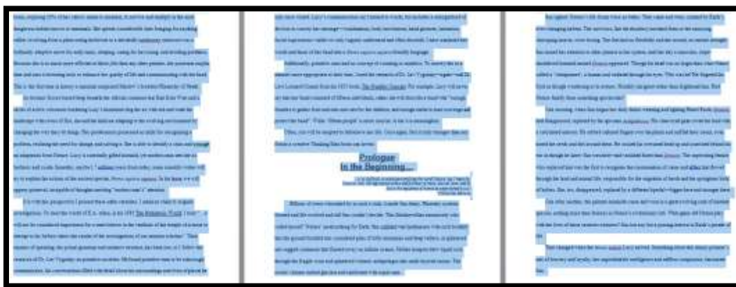
Figure 3—1000 words