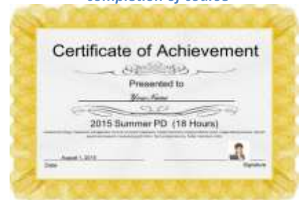
Sample certificate received at completion of course

Students teach classmates how to use webtools at the virtual meetings. Each takes about ten minutes and includes a screencast (or annotated screenshots) showing how to use the webtool. Student also posts an example of the webtool project and